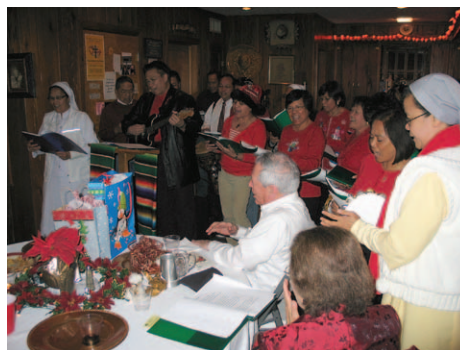
Filipino singers entertain by singing many favorite Christmas carols and songs.

Remember your day for the 31 Club. Please continue to pray for vocations daily.